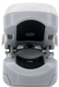
Soft-Slip finger case