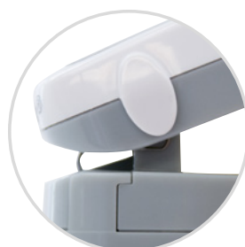
Robust spring mechanism