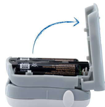
Hinged battery cover